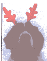
Zak Christmas 2001