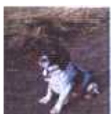
Angus Summer 2002