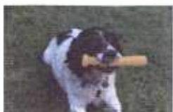
Jakey Summer 2001